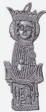
Pilgrim figure from St. Albert's Church

At Vejsnæs Nakke can be found the remains of St. Albert's Church. Originally built as fortifications that are believed to date back to the Viking Age around the year 1000AD, it was in the fourteenth century that St. Albert's Church established there. Archaeological evidence found at the site indicates that the church was in use until the Reformation in 1536. Today the foundations of the church are clearly marked by the linear earth mounds.