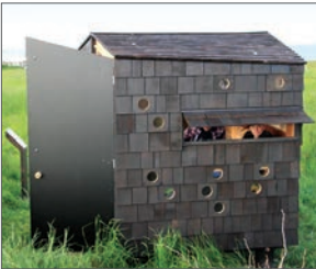
Shelters at Birkholm. For bookings, go to www.bookens-helter.dk

Birkholm is one of Denmark's smallest inhabited islands. Located in the middle of the South Funen Archipelago, Birkholm is only 96 hectares in size, relatively flat and only 1.8 meters above sea level at its highest point. Birkholm belongs to the municipality of Ærø and is served twice a day by a small modern postal boat, which can also carry a modest number of passengers. See more at www.birkholm-beboerforening.dk .