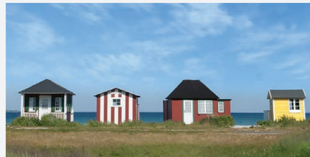
Beach huts at Vesterstrand.