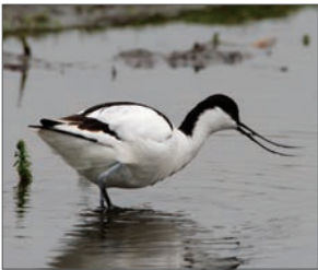
The Pied Avocet breeds on Vitsø's bird islands

Orinally, Vitsø Nor was a fjord. In 1781, it was drained in order to reclaim land and thus became a meadow that was grazed by cattle. It wasn't until 1964 that the level of salinity in the soil fell sufficiently for the land to be used for agriculture. In 2009, the freshwater lake and the marshes (a total of 112 hectares) were re-established, thereby creating the nature reserves of Vitsø and the wetlands of Søby Måe. They have subsequently become important breeding centres for many species of migratory birds, which nest on the many small islands in the lake. A trail has been established all around Vitsø, from which birdlife and nature can be experienced at close hand. A leaflet on Vitsø and Søbygaard is available.