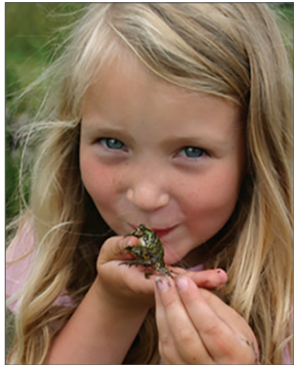
Kiss the frog