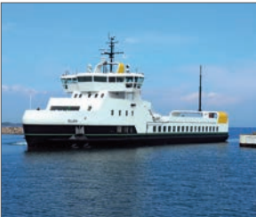
Ellen in Søby harbour

E/F Ellen is Ærø's new electric ferry! She has a battery capacity equivalent to 28,000 lawnmower batteries and is capable of covering a greater distance between each battery charge than any other all-electric ferry. Ellen is the result of a five-year innovation project and is among Realdania's 100 best Danish climate solutions. Her main route is Søby-Fynshav.